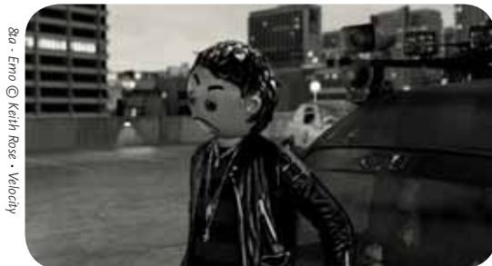
8a - Erno © Keith Rose - Velocity