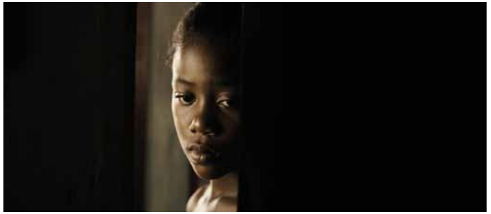
Life, Above All